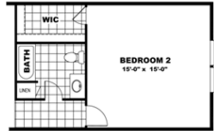
DUAL MASTER SUITE OPT.

Our home building facilities invest in continuous product and process improvements. Plans, dimensions, features, materials, specifications and availability are subject to change without notice or obligation. Renderings and floor plans are representative likenesses of our homes and may differ from the actual homes. We invite you to tour a Home Center near you and inspect the highest value in quality housing available or call (919) 774-1125 to speak with a Home Consultant. Copyright 2017, CMH. All rights reserved.